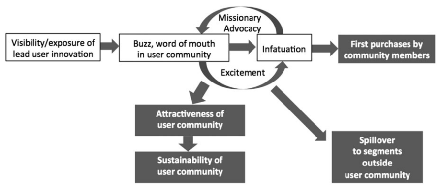
Figure 4. Synergy: Creation of Buzz Adapted from Fournier and Dolan (2002).

community members and in turn to a kind of missionary advocacy about the brand and the lead user innovation: a virtuous cycle of word of mouth emerges. We find that some of these processes elevate to more extreme advocacy for a particular lead user innovation: