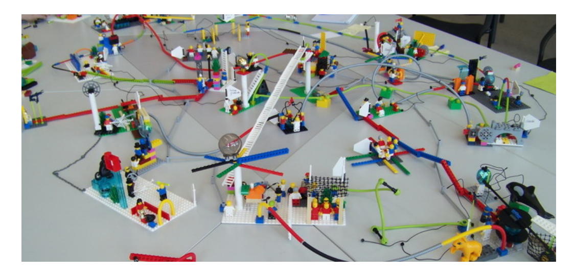
Fig.2: Team life model of the research group