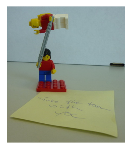
Fig.3: Take the team with you