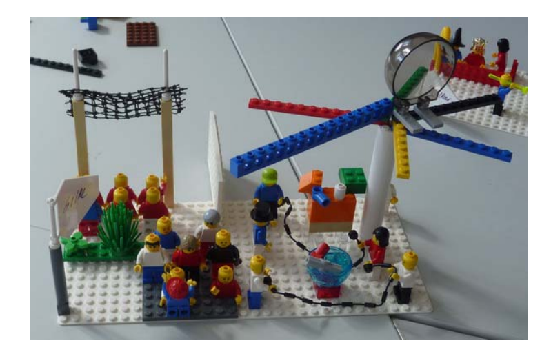
Fig.1: Individual model of a team member