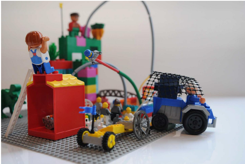
Figure 1: Model depicting limited space and unsuitable vehicles

Analysis of the model's architecture exposed reoccurring metaphorical themes. The repetition of imagery such as obstacles courses, a Berlin wall and barriers all inhibited their professional performance. Models frequently depicted heavily loaded people and vehicles. Vehicle models in particular were built haphazardly inferring inconsistency, improvisation and inappropriateness of design rather than a coherently designed service (Figure 1). The use of visual recording equipment enabled a participant's oral descriptions of their models to be captured with 100% accuracy.