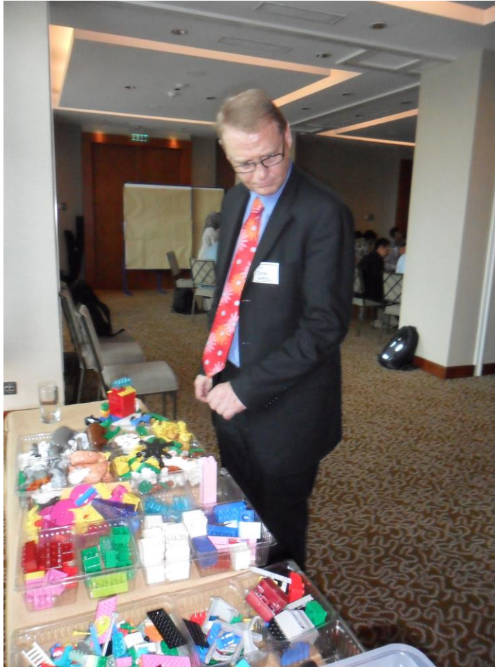
Figure 4. A participant in the Stakeholder Workshop on Energy Efficiency chooses his bricks.

Over 30 participants from almost as many organizations took part in the Stakeholder Workshop on Energy Efficiency. In addition to the workshop cosponsors, participating stakeholders included international donors, academic and research institutions, organizations promoting energy management standards, and government ministries. The model building exercises designed by CAPRESE for the daylong event first familiarized participants with the process of creating and explaining metaphors using the bricks (see Figure 4).