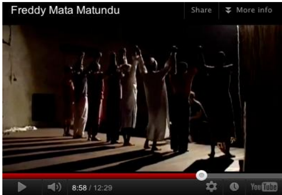
Figure 1. Video clip of a Mabin'a Moboko performance.