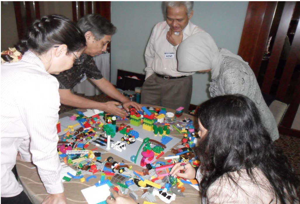
Figure 5. Participants in the Stakeholder Workshop on Energy Efficiency develop a shared idea of Indonesia's energy future.

One clear strength of the serious play process employed by CAPRESE is the space it created for participants to work through a complex problem via carefully crafted building challenges and facilitated group discussion (Gauntlett & Holzwarth, 2006, p. 86). The reflective activity of building a model provides an opportunity for participants to actively engage with a question or problem that they may not be able to address in any depth immediately or in words alone. Defining a comprehensive energy efficiency strategy for Indonesia in the face of global climate change is a good example of a complex problem with no immediate solution. CAPRESE's approach of asking participants to agree on an ideal state before identifying how their current actions contribute to that ideal could be applied to any development challenge (e.g., maternal health, food security, good governance). Moreover, the potential of three-dimensional (3D) model building (using Lego bricks or an alternative medium) to encourage dialogue and collaboration across institutional, national, and professional divides applies at both the macro (e.g., national policy making) and micro (e.g., project) levels of international development (see Figure 5).