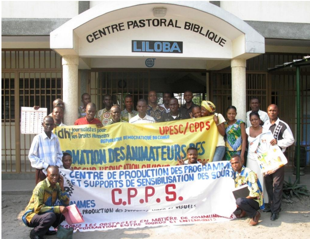
Figure 2. Establishing a local club following a performance.